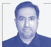
Saeed Al-Thani UAE 2018–2021