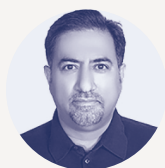
Saeed Al-Thani UAE 2018–2021